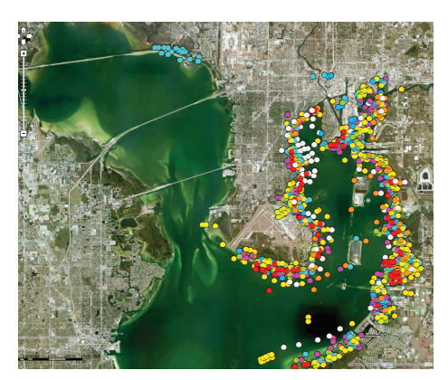
A view of the Bay Study Group data collection as visualized through the Geoportal and Data Repository. Dots link to different kinds of scientific reports.

In addition to mapping the Bay Study Group project, the USF Geoportal and Data Repository hosts data from researchers across USF and partner institutions. In 2012, the Karst Information Portal and Gulf Oil Spill Information Center will begin to take advantage of the GDR data visualization capabilities as well. The USF Scholar Commons, where the digitized collection of Bay Study Group documents is housed, is a significant new USF initiative allowing faculty and students to post research and creative work for unrestricted viewing. More than a collection of individual papers, the USF Scholar Commons is