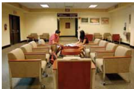
New modular seating creates flexible study spaces in the USF Tampa Library.

spend more time on academics. We've worked hard over the past year to make access to library resources fast, easy, and service-oriented via our website, and it is a pleasure to begin to make our building as easy to use as our online resources are. In addition to staying open 24 hours a day, from noon Sunday to 6 P.M. Friday, we doubled the number of computers available in the first-floor Learning Commons, and removed 100,000 volumes of printed journals in order to increase dedicated study space. Our website has added a convenient new consortial chat service, allowing us to greatly expand the hours during which patrons can get help online. Our mobile website allows users to access myriad library services from their phones, and will launch in full in early 2011. Our students demand anywhere, anytime, any-device access, and that is what we aim to give them.