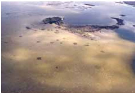
Bay Study Group Port Tampa image

IN 2010, THE USF TAMPA LIBRARY RECEIVED A NUMBER OF IMPORTANT COLLECTIONS. AMONG THESE ARE THE COMPLETE ARCHIVES of the Bay Study Group. Established in 1976, this group of marine and environmental biologists was charged with monitoring water quality in the Tampa Bay estuary. After documented environmental problems in the 1960's due to an excess of waterborne nutrients, the Bay's health was expected to improve in response to the City of Tampa's new advanced wastewater treatment system. In a matter of years, the level of problematic nitrogen was reduced by 90%. The return to health of Hillsborough Bay, Old Tampa Bay, and the larger estuarine system became an internationally-known success story of environmental remediation and rebirth.