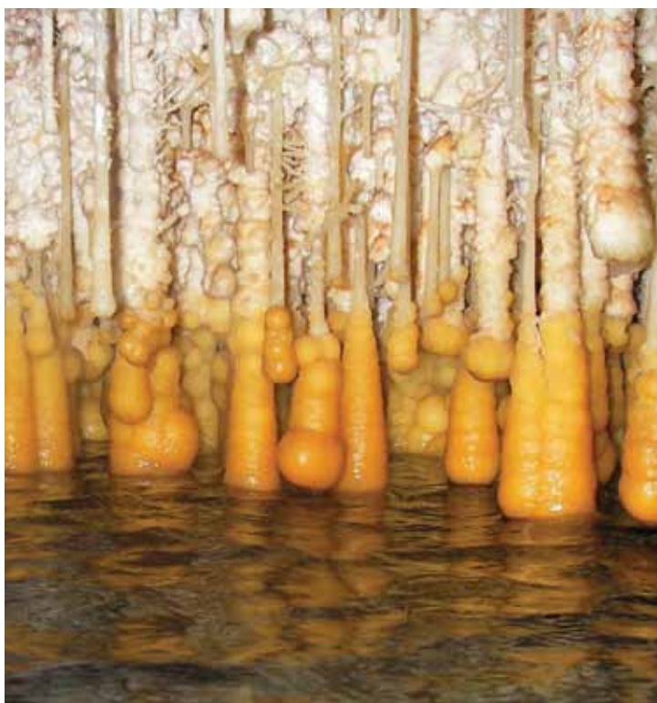
These encrusted speleothems (stalactites) in Vallgornera Cave on Spain's Mallorca island were used to reconstruct past and present sea-level fluctuations, giving researchers valuable data about the planet's climate record.

The Libraries have begun publication of the International Journal of Speleology (IJS) , the official journal of long-time KIP collaborator Union Internationale de Spéléologie, as an open-access publication, with the Libraries