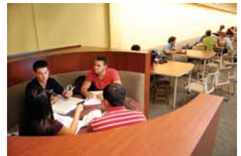
Renovated Learning Commons study areas.

The opportunity provided by Provost Wilcox to renovate selected intensive-use areas of the USF Tampa Library permitted us to reevaluate the location of reference and Writing Center services within the overall Learning Commons environment. After study and consultation with faculty and students, Academic Services librarians and Writing Center staff chose to relocate the Writing Center next to the reference service desk in a new, refurbished area designated for research and writing support services. The flexible new space allows for expansion of services to accommodate the growing need for student writing support. Its proximity to the reference desk allows librarians and Writing Center staff to work together and easily refer students. The thoughtful reconfiguration of the Writing Center, reference, and circulation areas increases communication among all staff to better address student needs, ultimately contributing to student success at USF. ✨