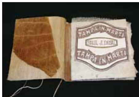
Inside front cover of Tampa in Martí