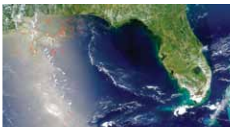
USF College of Marine Science satellite image

In the second half of 2010, the mission of the GOSIC portal was refined increasingly toward providing a repository for scientific data gathered by USF marine scientists and researchers affiliated with the 20 member institutions and agencies of the Florida Institute of Oceanography (FIO).