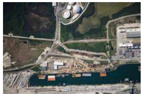
Aerial photo of Port Tampa