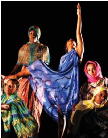
What the Heart Remembers: The Women and Children of Darfur