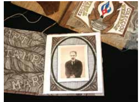
Interior book detail from Tampa in Martí

Several of these limited edition works of art will be given to major donors in the Libraries' current capital campaign in appreciation for their support. ✱