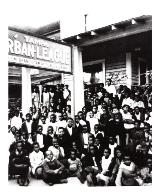
Tampa Urban League - Harlem Branch Public Library (c. 1940), from the African Americans in Florida project archive

Program website. The Oral History Program provides access to over 500 interviews on a wide variety of topics, including Ybor City, Tampa arts and culture, Florida foodways, civil rights, Holocaust & genocide studies, and economic development and