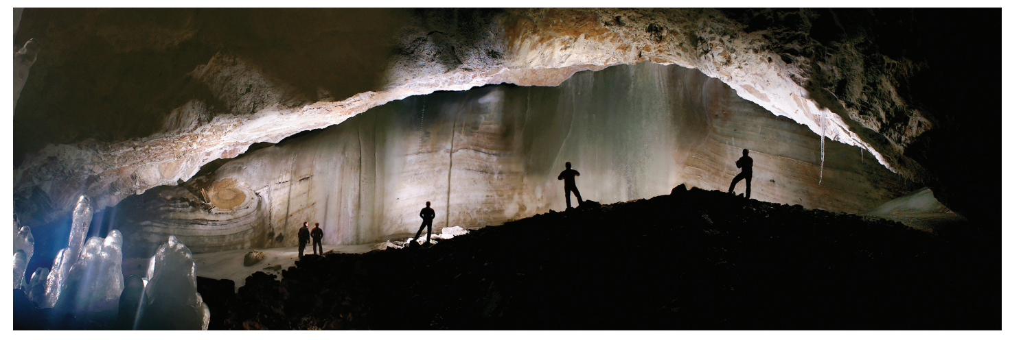
Scărișoara Cave, Apuseni Mountains, Romania