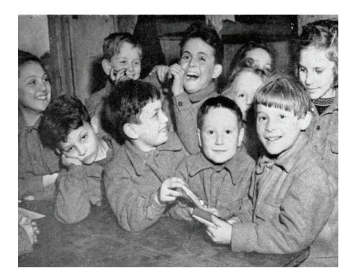
A group of young Holocaust survivors during the Brecha , an organized underground operation moving Jews into Palestine between 1944 and 1948. From Home: Through the Vale of Tears (1949).

USF and the Florida Holocaust Museum (FHM) have inked an official affiliation agreement, paving the way for a number of collaborations. Chief among these is that the Museum's library will become an affiliate of the USF library system, sharing its collections and benefiting from the USF Tampa Library's cataloging expertise. Special Collections' Oral History Program staff are also working to transcribe and make available a host of existing interviews